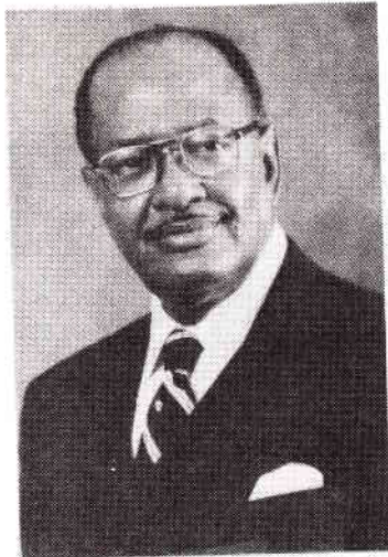
Dr. T. J. Jemison