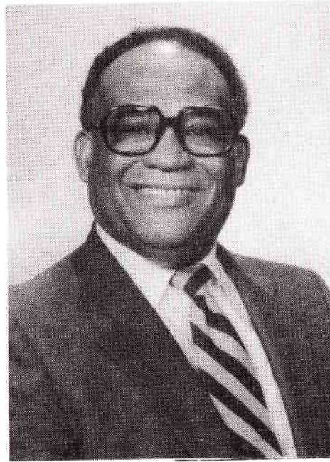
FROM THE PRESIDENT

I bring you greetings from the American Baptist College Community. For more than 6 1/2 decades the College has fulfilled its mission of providing quality education for ministers, church leaders, curriculum editors and writers, and other church workers. We are proud of our tradition of working with our churches in the servant role.