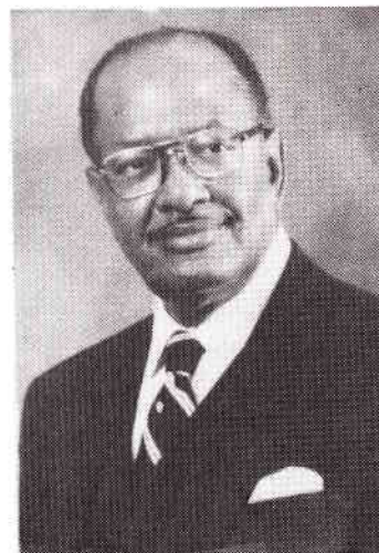
Dr. Theodore J. Jemison President, National Baptist Convention, USA Inc.