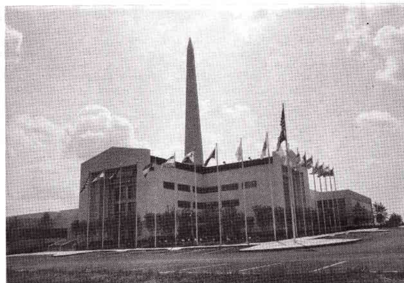
BAPTIST WORLD CENTER