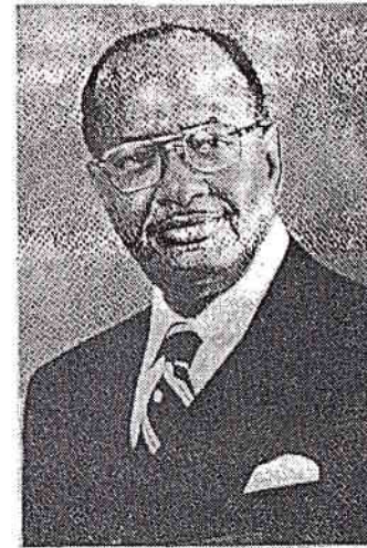
Dr. Theodore J. Jemison President, National Baptist Convention, USA Inc.