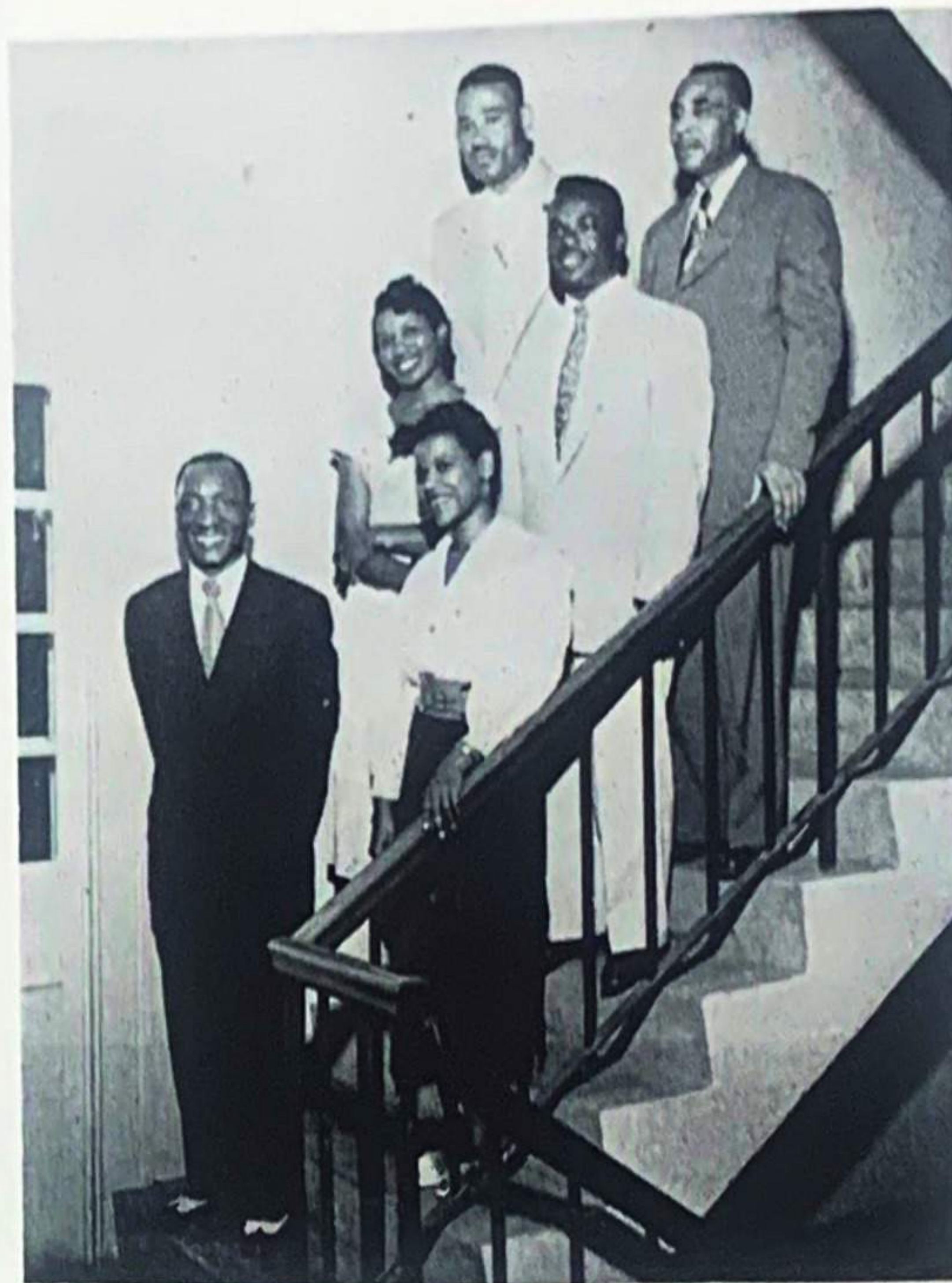
INTERSEMINARY MOVEMENT OFFICERS