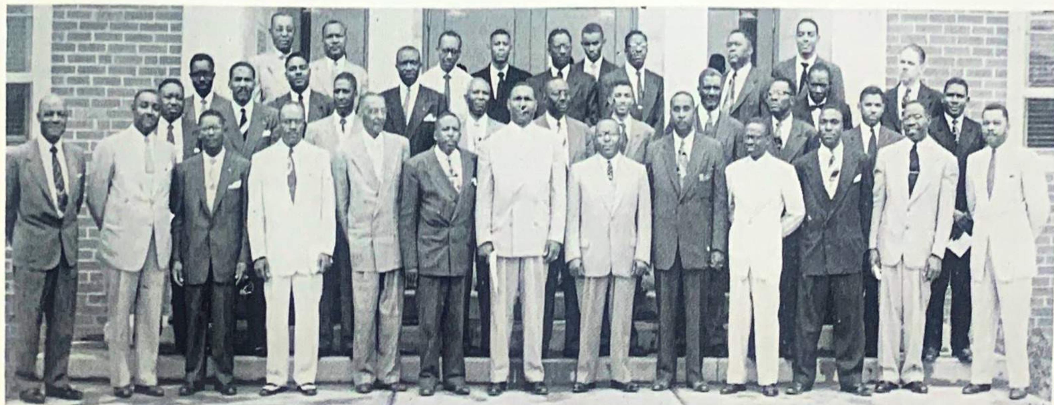
Alumni attending 1954 Commencement

From all indications, the Seminary will reach the century mark in enrollment for the school year 1954-55. New applications are being received daily, and this year, for the first time, a special appeal will be made to the youth attending the Sunday School and Baptist Training Union Congress.